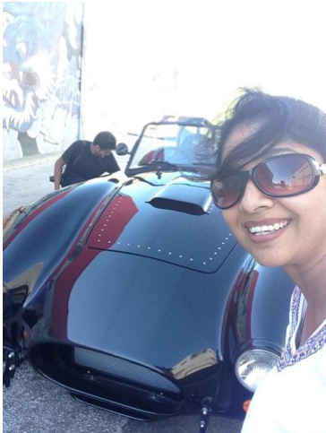
Selfie with the cameraman, why not?

This change will directly impact search ranking; giving priority to websites that function properly on any mobile device. Thankfully, we deliver mobile friendly websites so our clients will not be affected by this change.